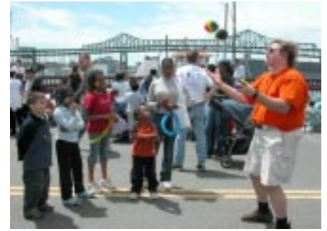
Fun at the River Revel! / ¡Diversión en el festival!

The Chelsea River Revel also showcased the hard work of the Chelsea Creek Restoration Partnership (CCRP) – made up of CCAG (organized by NOAH and Chelsea Green Space) and UEI. These partners have been working together since 1998 to improve the Chelsea River. The CCRP's mission is restoring this important urban natural resource as an environmental, educational, recreational, and economic asset for East Boston, Chelsea, and the region. A major victory for the CCRP is the new Urban Wild park in East Boston. On behalf of the CCRP, NOAH would like to thank our many sponsors for their support of the inaugural Chelsea River Revel. Everyone had a great time! □